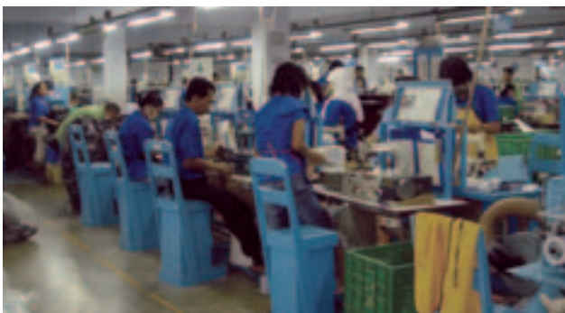
Workers in Thailand.

“I find I could earn only 2-3 yuan an hour in this factory,” one worker told us. The minimum monthly wage in Dongguan translates into approximately RMB4.20 an hour (US$0.60). “For me, the most annoying thing is that there is no overtime premium in this factory. Even if I work in the weekends, I can get only the normal wage rate.”