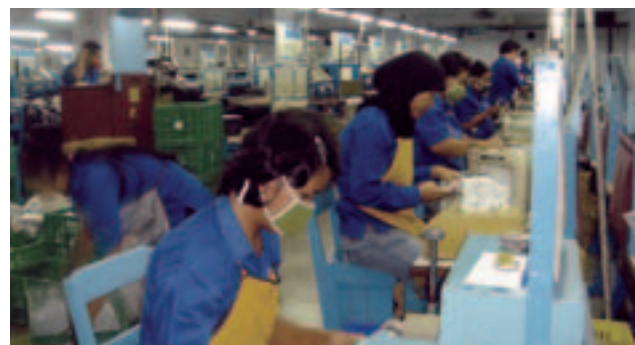
Workers in Thailand.

“We have no savings so we have nothing left during emergencies,” said a 50-year-old soccer ball stitcher. There are also few if any safety nets available for homeworkers: sickness or an accident can amount to a catastrophe. “I have lost my wife’s gold, which I gave as security to a money-lender and could not repay,” he said. “Once I even rented my cooking gas cylinder to arrange some money for a health emergency suffered by my wife. The situation is similar for all of us. One of my friends even sold his blood to get some extra money to meet an emergency.” 199