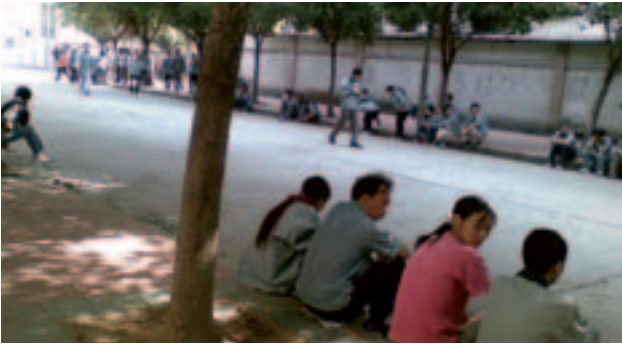
Kuan Ho Sporting Goods (Dongguan) Company in China: Workers taking rest outside the factory building after having lunch. (November 2007)