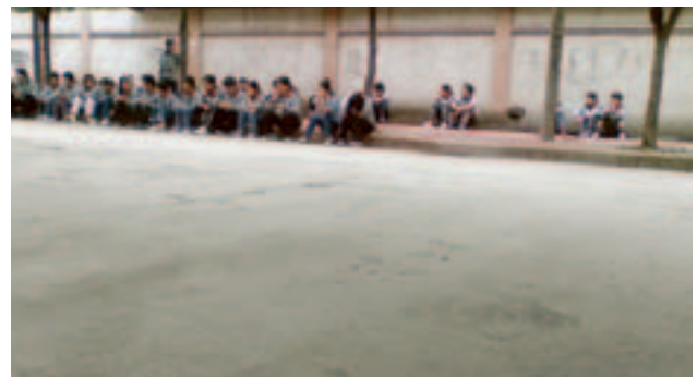
Kuan Ho Sporting Goods (Dongguan) Company in China: Workers taking rest outside the factory building after having lunch. (November 2007)