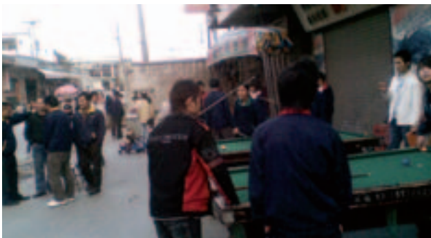
Joyful Long Sports (Dongguan) Manufactory in China: Workers taking rest and playing snooker game after lunch (outside factory building). (March 2008)

In this report, the Play Fair 2008 Campaign attempts to answer that question, and puts forward a series of demands and a timeline to achieve real, concrete improvements. Play Fair researchers interviewed over 320 workers from factories in China, India, Indonesia and Thailand about their wages, experiences, and working conditions. We also used secondary materials including company and industry profiles, published and unpublished reports, newspaper articles, web sites, and factory advertisements. Lastly, we conducted a workshop in Bangkok, Thailand in November 2007 involving labour rights activists from around the world to solicit their input. Through this research, we hope to present a rough overview of some of critical issues currently plaguing workers in the sportswear industry globally.