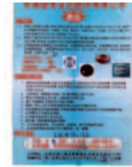
Kuan Ho Sporting Goods (Dongguan) Company in China: Recruitment notice and simple factory introduction. The notice includes the major clients of the factory and also states that the average wage is around 1,200 yuan. (November 2007)

Nonetheless, labour rights advocates should take note of the kinds of the concerns being given the most attention by sportswear companies and multi-stakeholder initiatives (MSIs), and which are not. For example, while some process-based purchasing practices like short lead times and excessive design changes are now cited in recent corporate social responsibility reports, a frank discussion of how low prices paid by buyers to suppliers impact on wages is harder to find.