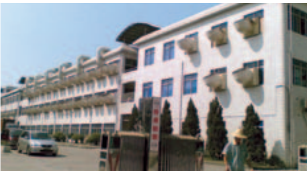
Kuan Ho Sporting Goods (Dongguan) Company in China: Factory main entrance. (November 2007)