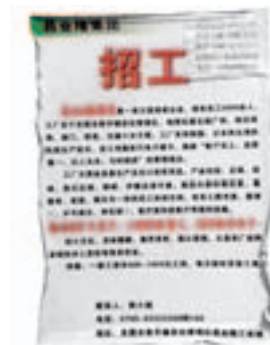
Joyful Long Sports (Dongguan) Manufactory in China: Recruitment notice and simple factory introduction outside the factory building. The paper on the top right corner states that factory wage range from 850 to 1,800 yuan. (March 2008)

In Chapter II, we review the 2004 Play Fair Alliance Programme of Work and assess how leading sportswear companies have responded to date.