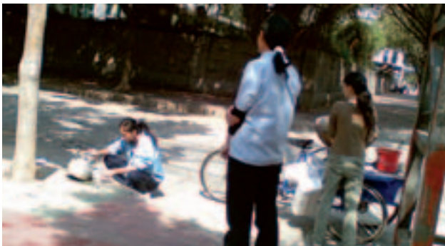
Kuan Ho Sporting Goods (Dongguan) Company in China: A worker taking water from a hawker after buying food from the hawker in lunchtime. (November 2007)

In 2006, Oxfam International issued its Offside! report, which evaluated company progress on the Programme of Work , particularly on the issue of freedom of association and collective bargaining. While Oxfam found that some companies had made efforts in particular factories, progress has been limited. Further, the report concluded that there is “little progress to report in terms of sports brand owners addressing the impact of their buying practices – price, delivery time and stability of business relationship – on workers’ rights.” 43