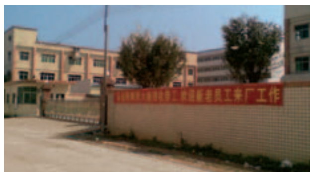
Joyful Long Sports (Dongguan) Manufacturing plant in China: Factory main entrance and recruitment banner. (March 2008)

Reports of "sweatshop" abuses in the sportswear industry were not new, and, admittedly, some sportswear companies had taken initial steps to address some of these abuses prior to the Athens Games. But, as the Play Fair Alliance pointed out, those efforts were limited, either because real business practices have not matched lofty statements on corporate values, because labour standards commitments have not been effectively implemented, or because the best efforts of some brands have been undermined by poor practices of competitors using the same factories.