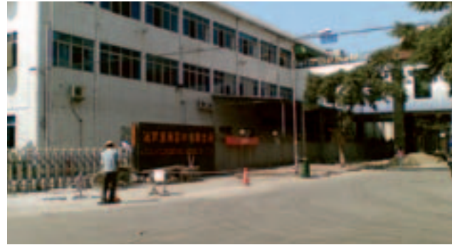
Kuan Ho Sporting Goods (Dongguan) Company in China: Factory main entrance and recruitment banner. (November 2007)